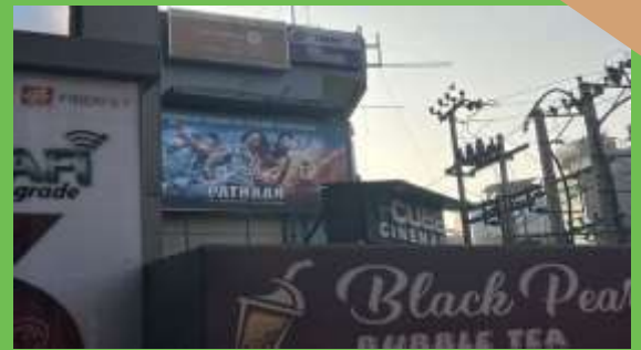
Above Box Office