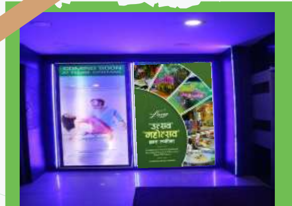
Wall Branding glass with back light near lift