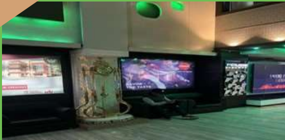
Wall Branding glass with back light