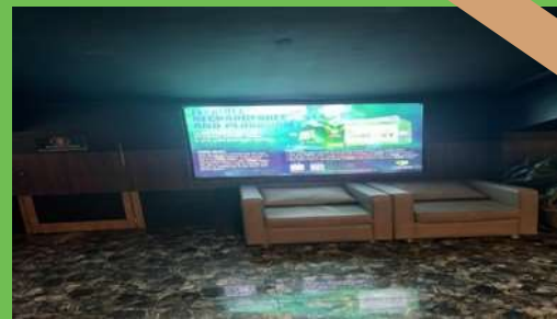
Wall Branding Acrylic with back light way to washroom