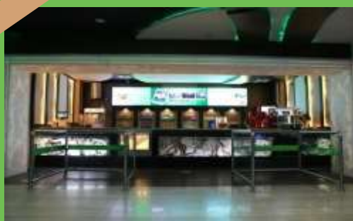
Video wall Digital Display food counter