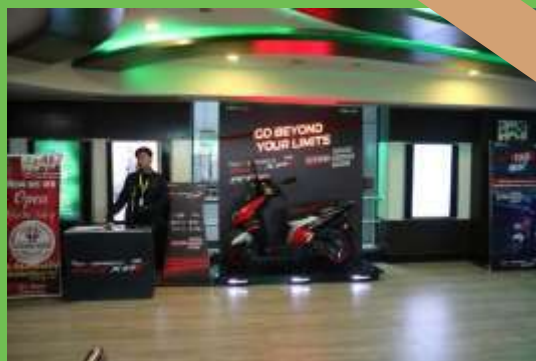
Product Display at concession near Food Court