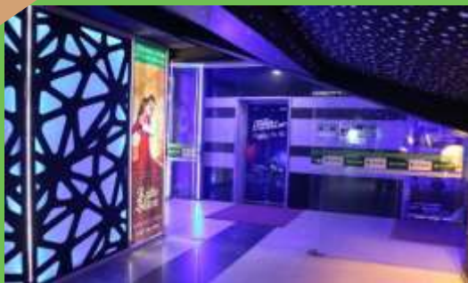
Wall Branding Glass with back light waiting area outside