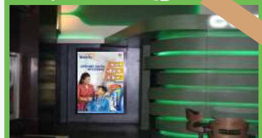
Wall Branding Glass with back light near Cube 1