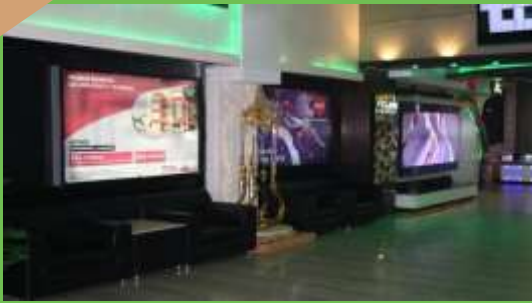
Wall Branding glass with back light waiting area of Cube1& 2