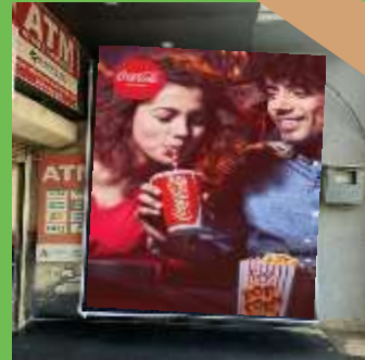
Near NIMB, Global IME ATM & Box Office