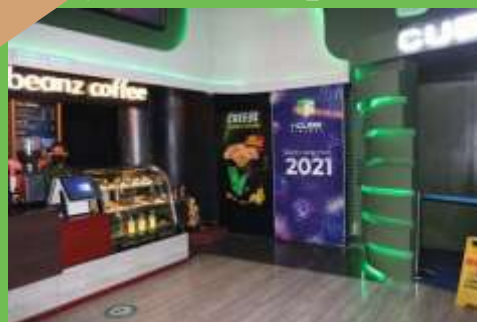
Wall Branding glass with back light near Cube 2 clearly visible from waiting area