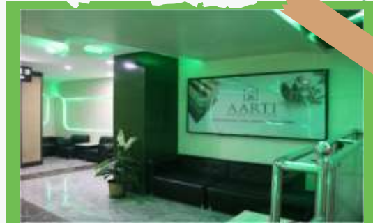
Concession 3 lobby left to stairs