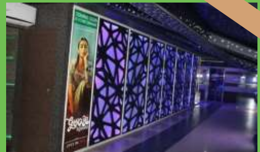
Wall Branding Glass with back light waiting area outside