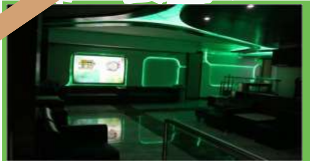
Concession 3 lobby left to stairs