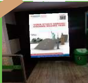
Wall Branding Glass with back light near concession (food counter)